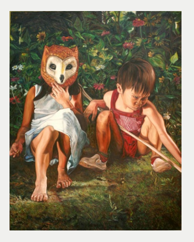
Yasmin Sison's Into the Woods (2009).