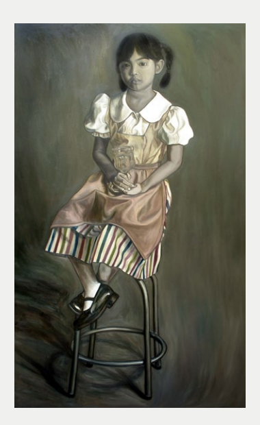
Yasmin Sison's Gingerbread Girls (2007).