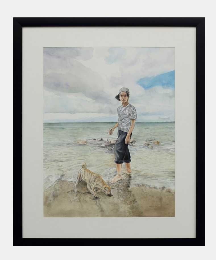
Dalawang Amihan, 2023 watercolor on Arches watercolor paper (300gsm) 24h x 18w in • 60.96h x 45.72w cm framed: 32.28h x 26.18w in • 82h x 66.50w cm