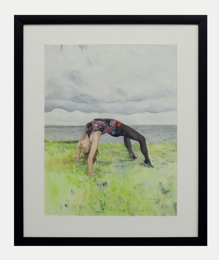
Chay, 2023 watercolor on Arches watercolor paper (300gsm) 24h x 18w in • 60.96h x 45.72w cm framed: 32.28h x 26.18w in • 82h x 66.50w cm