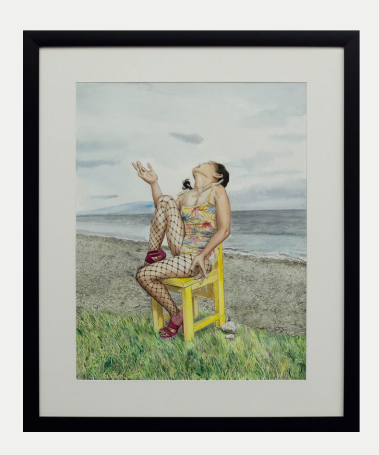
\label{eq:Vida and the broken red heel} Vida and the broken red heel} 2023 watercolor on Arches watercolor paper (300gsm) 24h\,x\,18w\,\text{in} \bullet 60.96h\,x\,45.72w\,\text{cm} framed: 32.28h\,x\,26.18w\,\text{in} \bullet 82h\,x\,66.50w\,\text{cm}