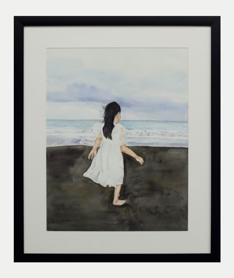
Likha, 2023 watercolor on Arches watercolor paper (300gsm) 24h x 18w in • 60.96h x 45.72w cm framed: 32.28h x 26.18w in • 82h x 66.50w cm