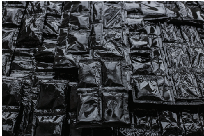
Urban Skin , 2019 resin 131h x 124.25w x 4d in (332.74h x 315.60w x 10.16d cm)