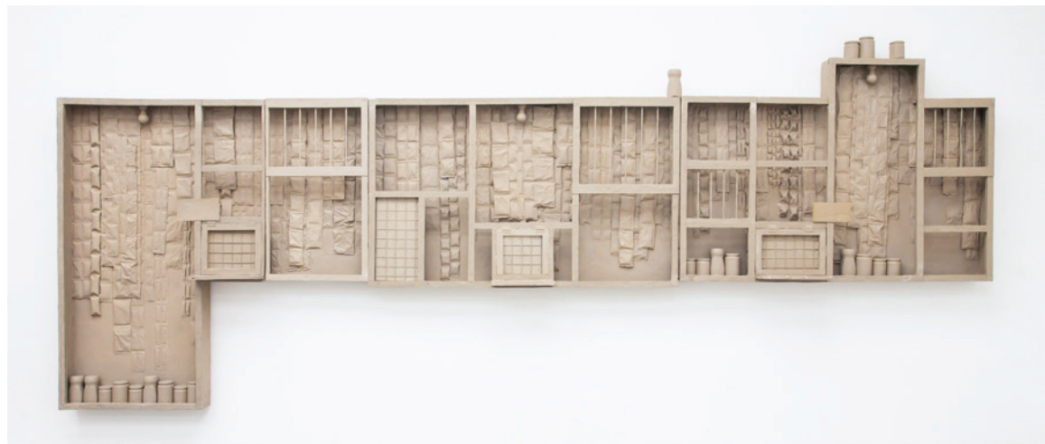
(Re)stored 2019 resin 86h x 217w x 12.25d in (218.44h x 551.18w x 31.12d cm)