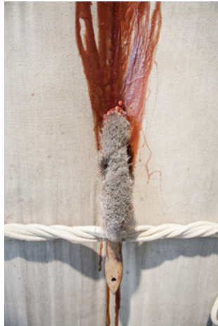
"Untitled # 4" After J.S. Bach's Partita No. 2 "Chaconne", 2019 assemblage 63h x 48w x 4d in (160.02h x 121.92w x 10.16d cm)