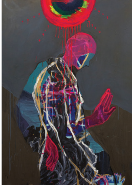
Future Resplendent , 2018 acrylic on canvas 84h x 60w in 213.36h x 152.40w cm