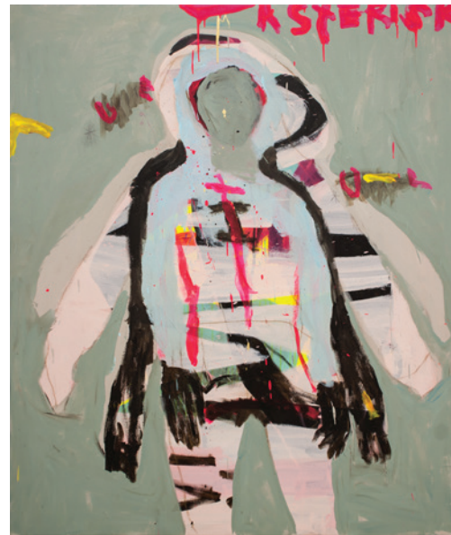
Asterisk , 2019 acrylic on canvas 72h x 60w in (182.88h x 152.40w cm)