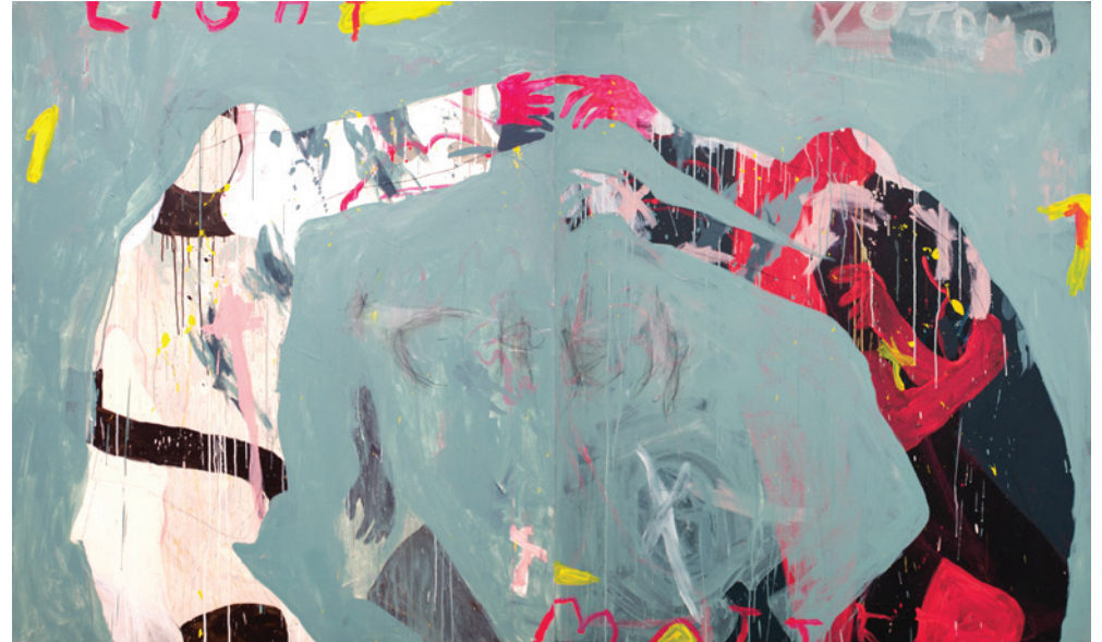
Invoke: Light to Matter to Spirit , 2019 acrylic on canvas 72h x 120w in · 182.88h x 304.80w cm (diptych)