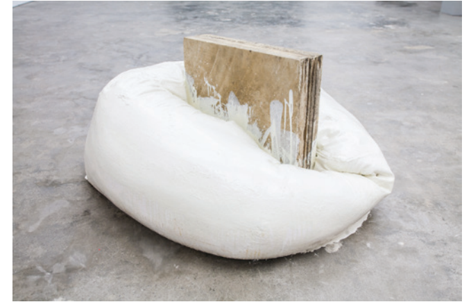
"Untitled # 2" After J.S. Bach's Partita No. 2 "Chaconne", 2019 assemblage 21h x 44w x 39d in (53.34h x 111.76w x 99.06d cm)