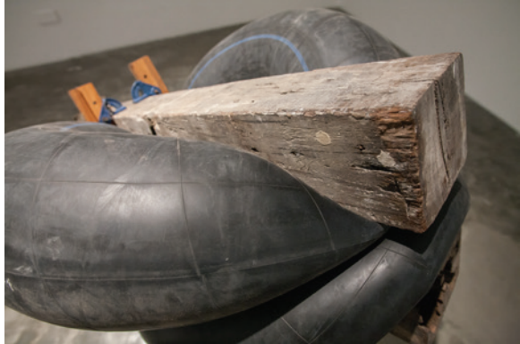
"Untitled #3" After J.S. Bach's Partita No. 2 "Chaconne", 2019 assemblage 39.50h x 60w x 32d in (100.33h x 152.40w x 81.28d cm)