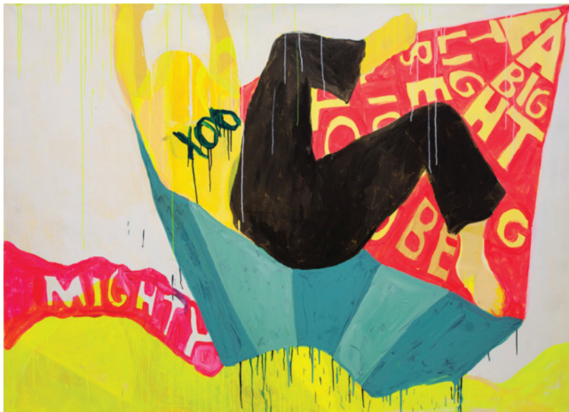
Mighty , 2018 acrylic on canvas 60h x 84w in (152.40h x 213.36w cm)