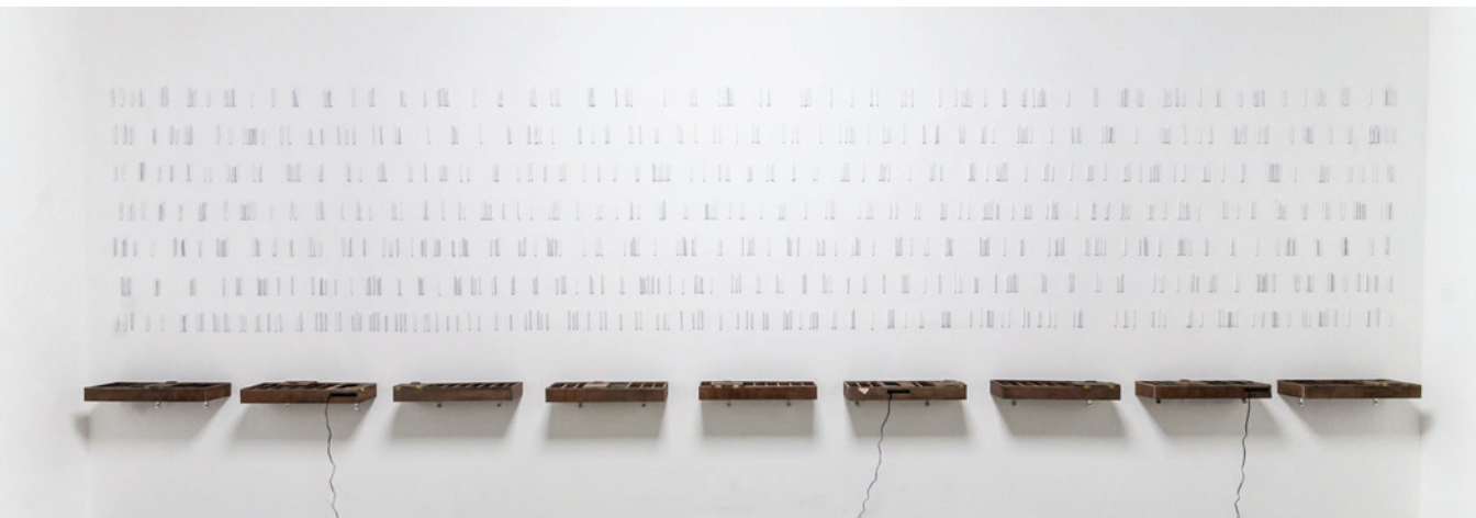
Making a Killing, 2019 resin cigarettes, takatak boxes, and three video screens dimensions variable