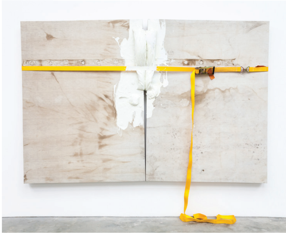
"Untitled #1" After J.S. Bach's Partita No. 2 "Chaconne", 2019 assemblage 72h x 110.25w x 7d in (182.88h x 280.04w x 17.78d cm)