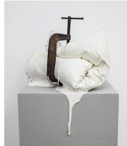
"Untitled # 5" After J.S. Bach's Partita No. 2 "Chaconne", 2019 assemblage 34h x 21w x 12d in (86.36h x 53.34w x 30.48d cm)