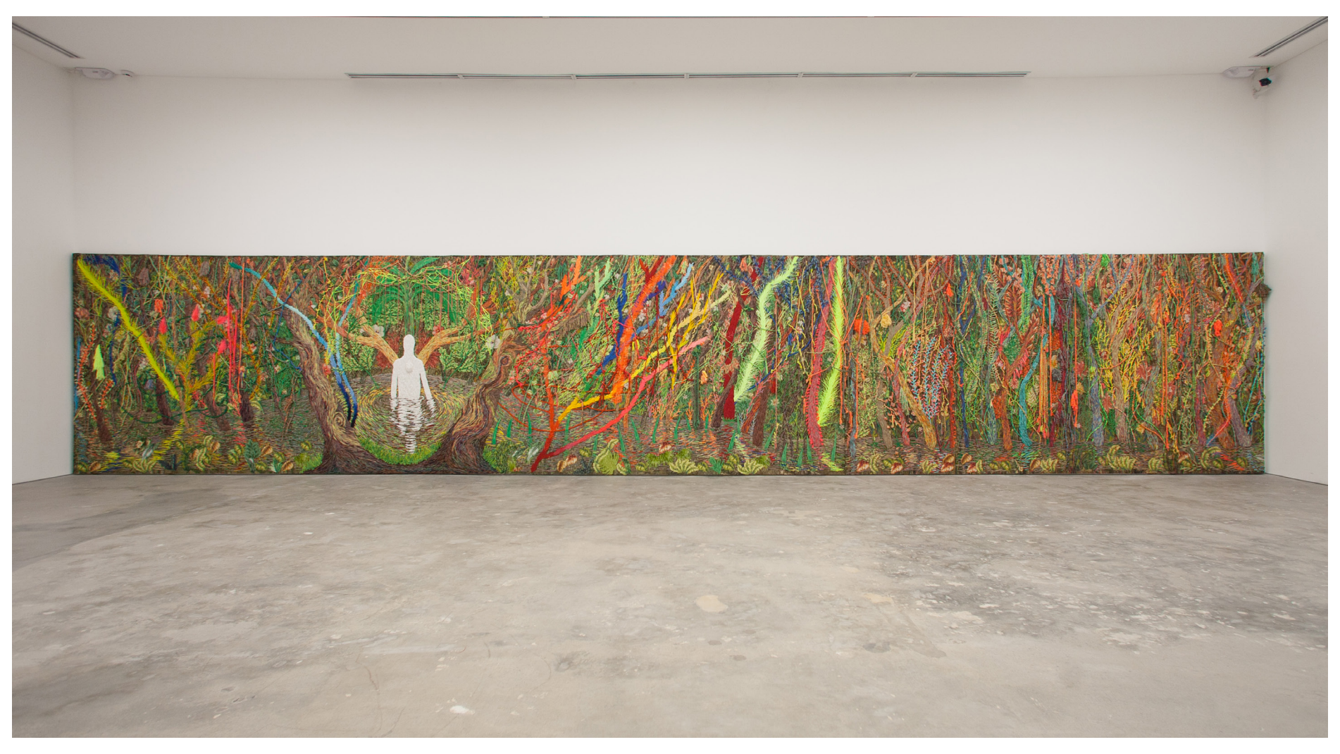
BUHAY, 2018 thread, acrylic, textile cloth 96h x 516w in 243.84h x 1310.64w cm