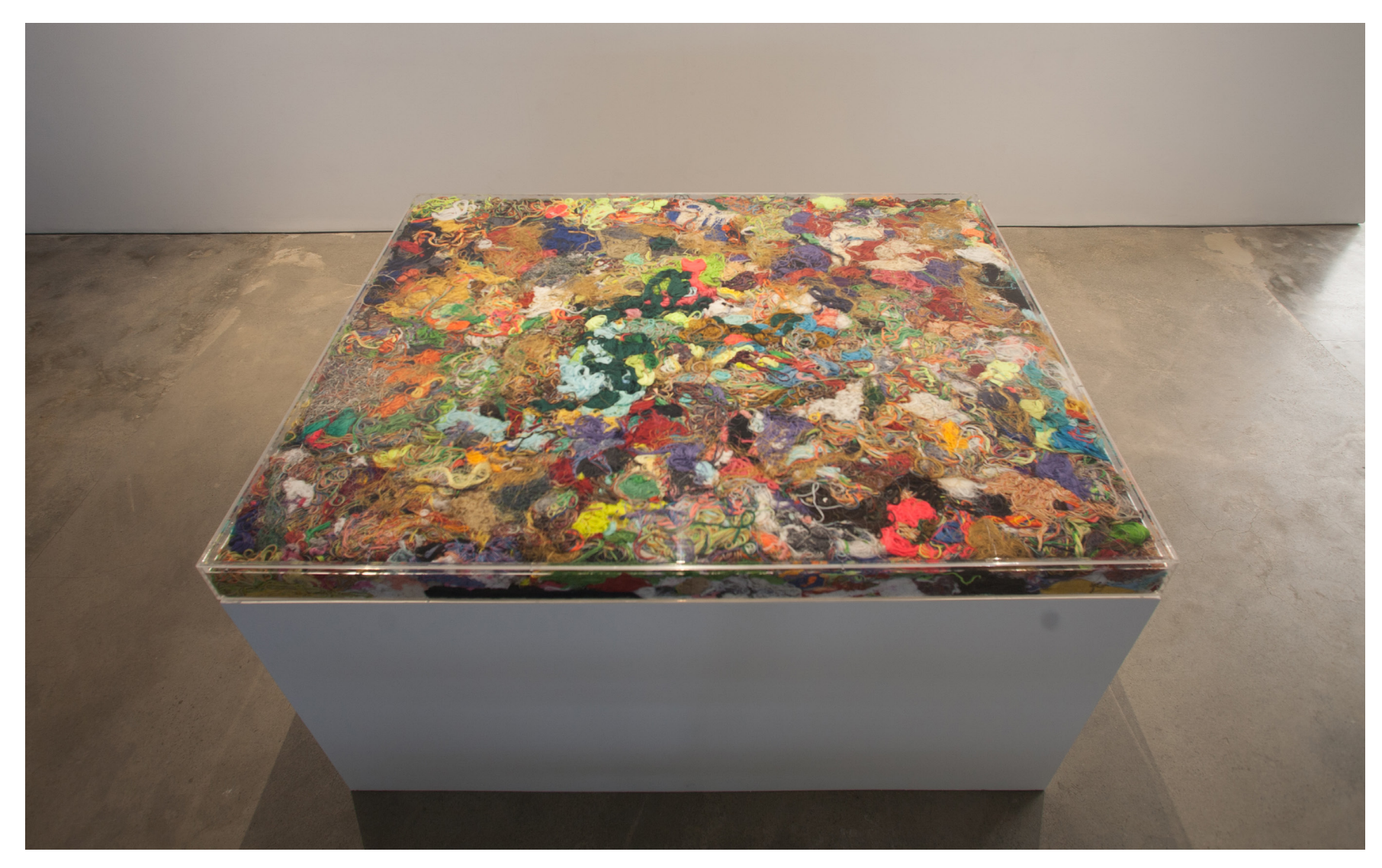
GROUND, 2017 thread on acrylic glass 42.90h x 54.50w x 3.25d in 108.97h x 138.43w x 8.26d cm