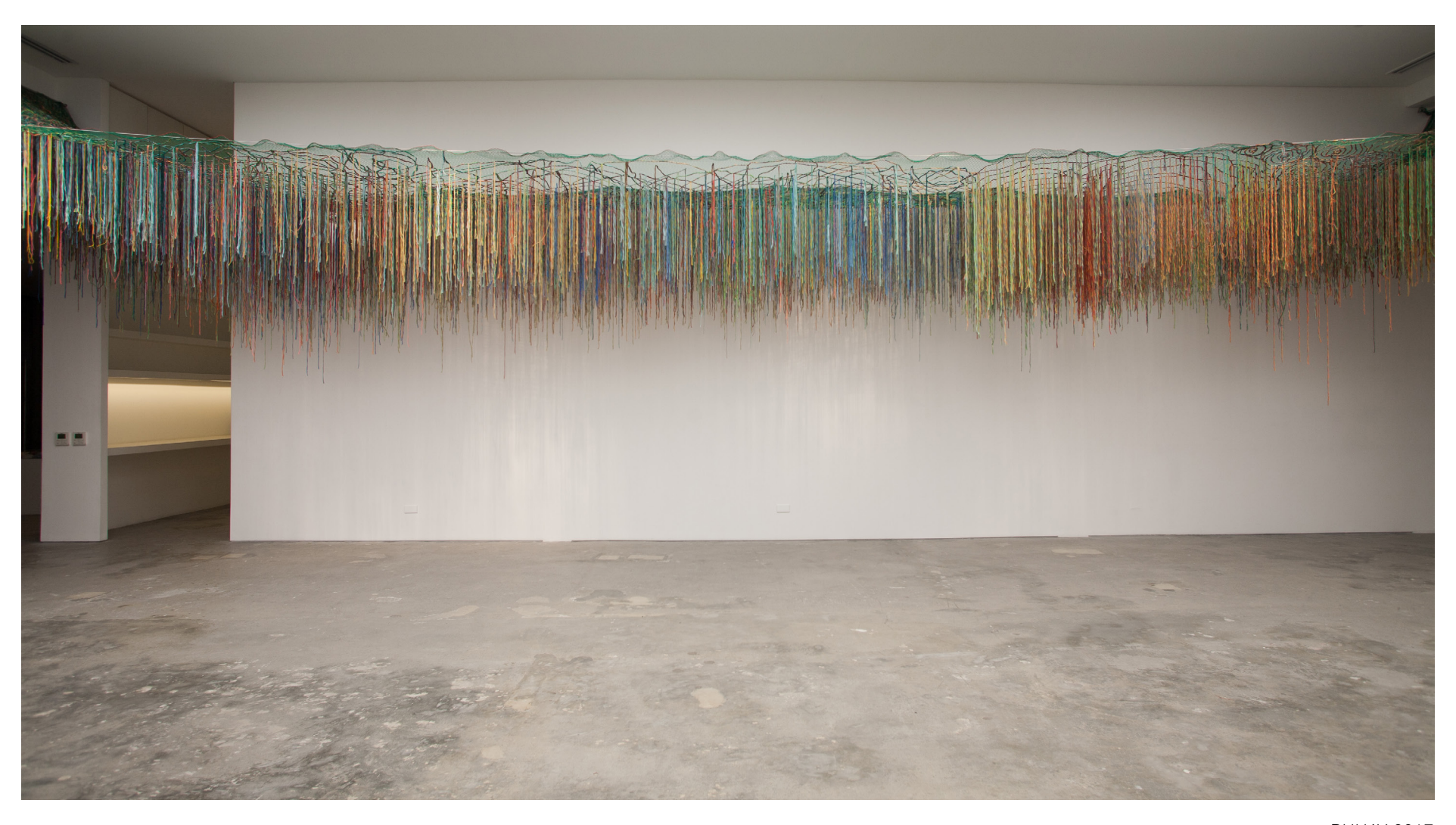
BUHAY, 2017 thread, nylon net dimensions variable