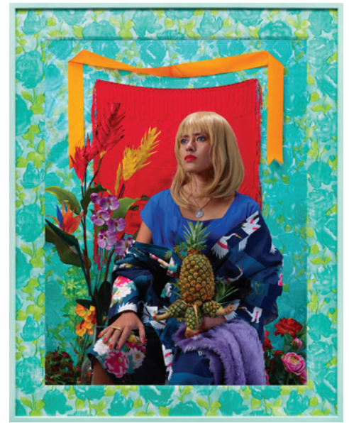
Remember Who You Are (Strange Fruit/The Other Asian, Self-Portrait with Pineapple) , 2019 archival pigment print on Hahnemühle, cold-mounted on acid-free aluminum, with artist's exhibition frame i.e. wrapped fabric on wood, colored frame 45h x 34w in (114.30h x 86.36w cm) Edition of 5 + 2 AP