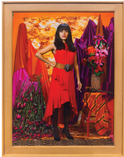
The Fire You're Made Of (Ignis Mirabilis, Self-Portrait After the Fire) , 2019 archival pigment print on Hahnemühle, cold-mounted on acid-free aluminum, with artist's exhibition frame i.e. double wood frame custom-tinted to WN skin tone 53.30h x 40w in (135.38h x 101.60w cm) Edition of 5 + 2 AP