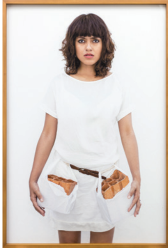
Self Portrait with Bricks (Autorretrato con ladrillos) , 2012 archival pigment print on Hahnemühle, cold-mounted on acid-free aluminum, with artist's exhibition frame i.e. wood frame custom-tinted to WN skin tone 41.34h x 27.56w in (105h x 70w cm) Edition of 5 + 2 AP