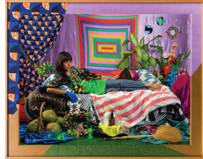
La Bruja (All the Places She's Gone, Self-Portrait) , 2019 archival pigment print on Hahnemühle, cold-mounted on acid-free aluminum, with artist's exhibition frame i.e. wrapped fabric on double wood frame custom-tinted to WN skin tone 40h x 52.50w in (101.60h x 133.35w cm) Edition of 5 + 2 AP