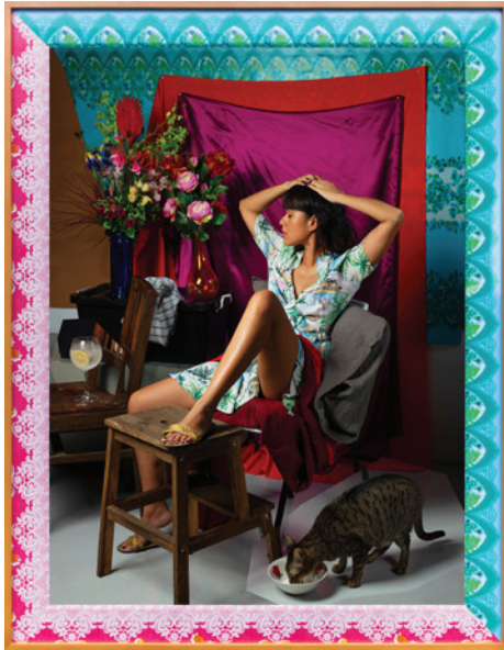
May in Manila/Hot Summer (After Balthus, Self-Portrait) , 2019 archival pigment print on Hahnemühle, cold-mounted on acid-free aluminum, with artist's exhibition frame i.e. wrapped fabric on double wood frame custom-tinted to WN skin tone 53.30h x 40w in (135.38h x 101.60w cm) Edition of 5 + 2 AP