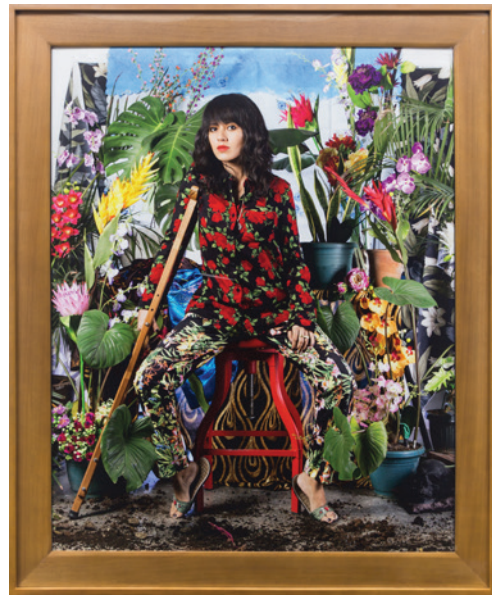
"I Want To Live A Thousand More Years" (Self-Portrait After Dengue, with tropical plants and fake flowers) , 2016 archival pigment print on Hahnemühle, cold-mounted on acid-free aluminum, with artist's exhibition frame i.e. double wood frame custom-tinted to WN skin 50h x 40w in (127h x 101.60w cm) Edition of 5 + 2 AP