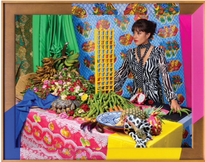
The Heap/Viva La Vida (Portrait of A Female Artist at 40, Self-Portrait) , 2019 archival pigment print on Hahnemühle, cold-mounted on acid-free aluminum, with artist's exhibition frame i.e. wrapped fabric on double wood frame custom-tinted to WN skin tone 40h x 53.30w in (101.60h x 135.38w cm) Edition of 5 + 2 AP