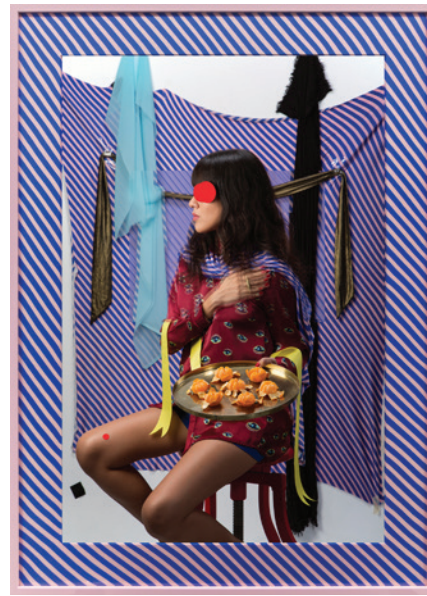
Start Here, A Lesson on Looking (Self-Portrait with Mandarins) , 2019 archival pigment print on Hahnemühle, cold-mounted on acid-free aluminum, with artist's exhibition frame i.e. wrapped fabric on wood, colored frame 45h x 30w in (114.30h x 76.20w cm) Edition of 5 + 2 AP