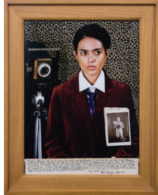
Self-Portrait for My Grandfather, the Photographer (after Frida Kahlo's Portrait of My Father / Retrato de Mi Padre, 1951) , 2007 Lambda C-print, cold-mounted on acid-free aluminum, with artist's exhibition frame i.e. double wood frame custom-tinted to WN skin tone 24h x 18w in (60.96h x 45.72w cm) Edition 7 of 10 + 2 AP