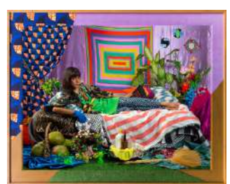
La Bruja (All the Places She's Gone, Self-Portrait), 2019