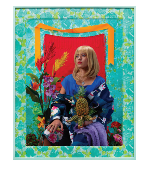
The Fire You're Made Of (Ignis Mirabilis, Self-Portrait After the Fire), 2019 archival pigment print on Hahnemühle, cold-mounted on acid-free aluminum, with artist's exhibition frame i.e. double wood frame custom-tinted to WN skin tone 53.30h x 40w in (135.38h x 101.60w cm) Edition of 5 + 2 AP

"I Want To Live A Thousand More Years" (Self-Portrait After Dengue, with tropical plants and fake flowers), 2016 archival pigment print on Hahnemühle, cold-mounted on acid-free aluminum, with artist's exhibition frame i.e. double wood frame custom-tinted to WN skin 50h x 40w in (127h x 101.60w cm) Edition of 5 + 2 AP