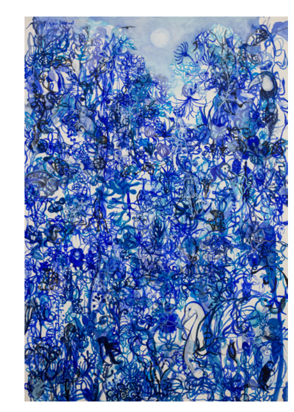
Popo San Pascual Puerto Princesa 1, 2020 acrylic on canvas 79.92h x 53.94w in 203h x 137w cm