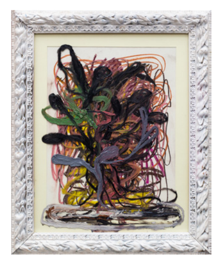
Jigger Cruz Untitled , 2020 pastel on paper and oil on glass 21.85h x 17.72w in 55.50h x 45w cm