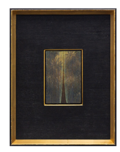
Gregory Halili Nostalgia , 2002 watercolor on arches paper 6h x 4w in 15.24h x 10.16w cm