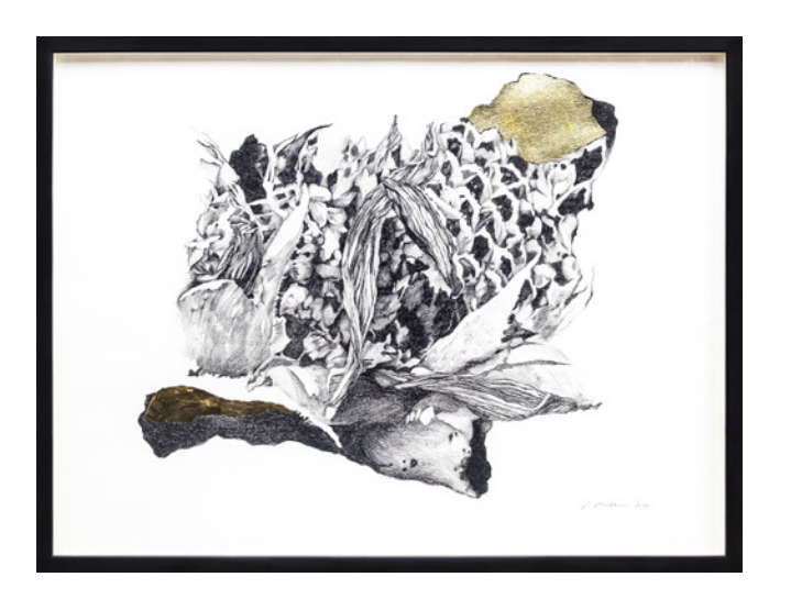
Patricia Perez Eustaquio Swarm 4, 2014 graphite and gold leaf on paper 18.90h x 24.88w in 48h x 63.20w cm