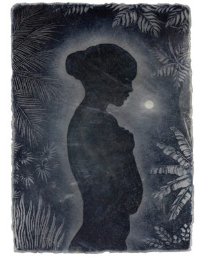
Gregory Halili Searching Sanctuary, 2020 oil on capiz shell 3.25h x 2.25w in 8.26h x 5.72w cm