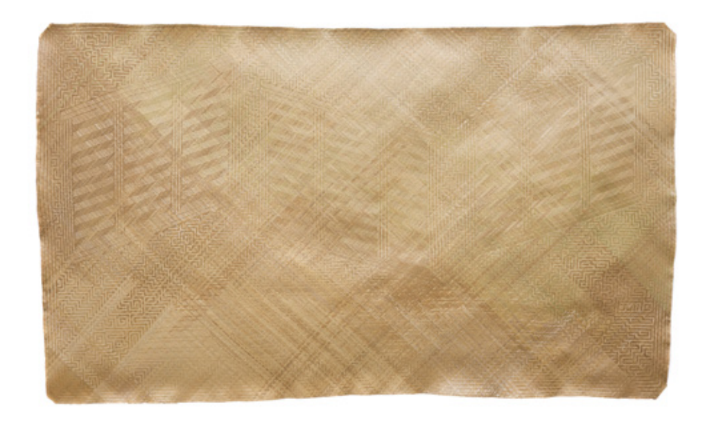
3 hovering Louvres, 2019 Split bamboo pus weave, black natural dye and matt sealant 76h \times 126w in (193.04h \times 320.04w cm)

with weaving by Julitah Kulinting, S. Narty Binti Raitom and Julia Binti Ginasius