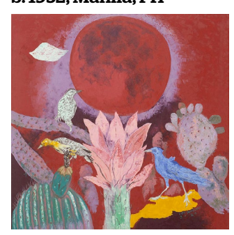
Flower Moon and Desert Sky, 2020