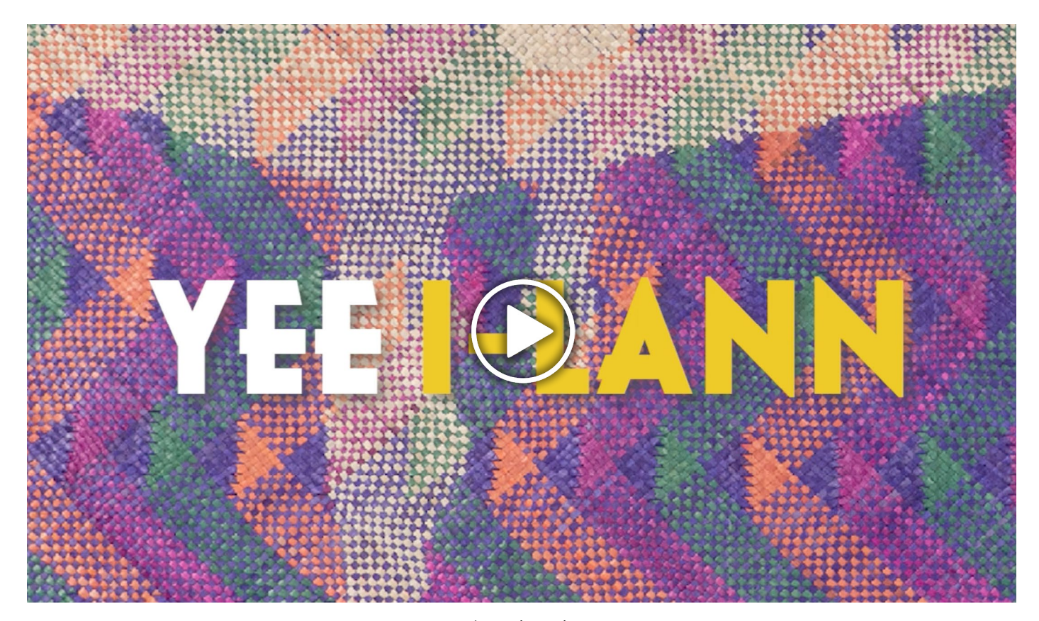
Tikar/Meja (2020) video