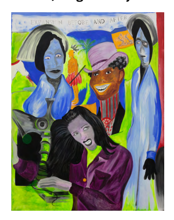
Nurse Core (Grinning in the Papers), 2022