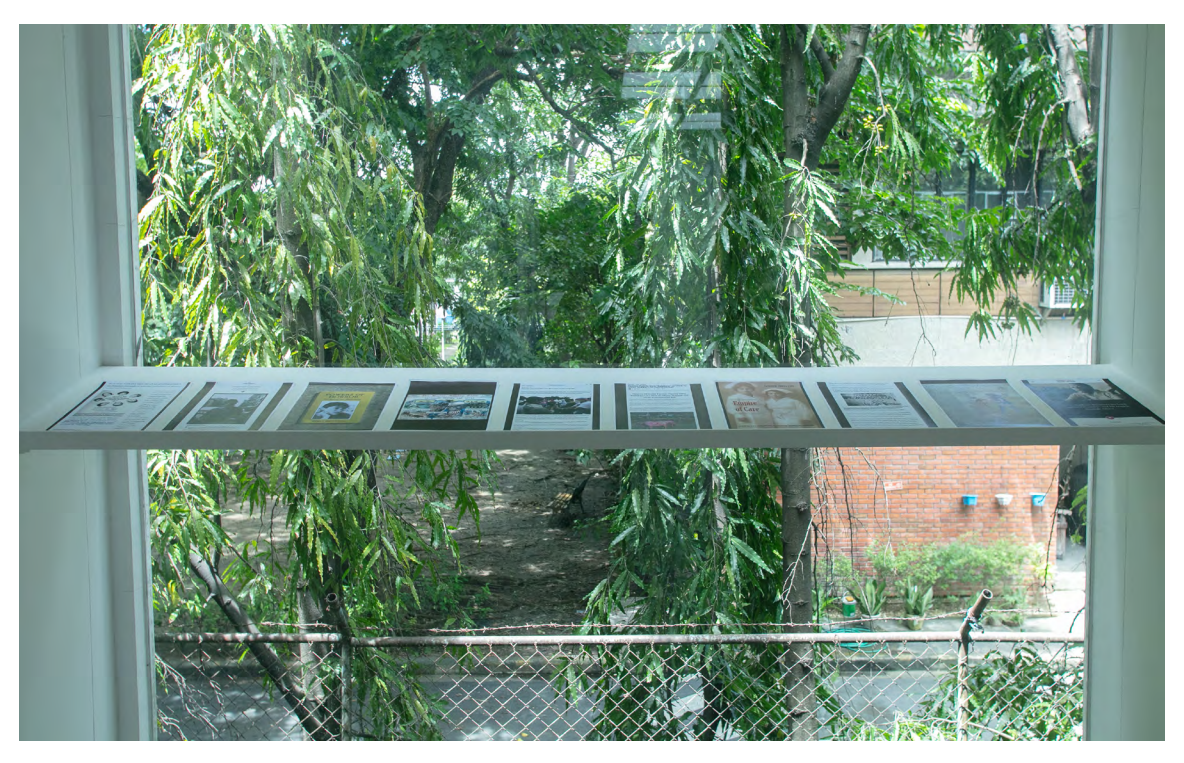
Live Archive , 2022. digital color prints. variable dimensions.