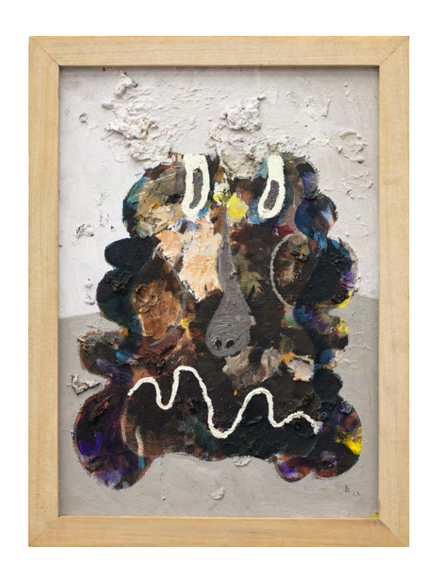
Head 5 , 2022 acrylic & oil on canvas 14h x 10w in • 35.56h x 25.40w cm