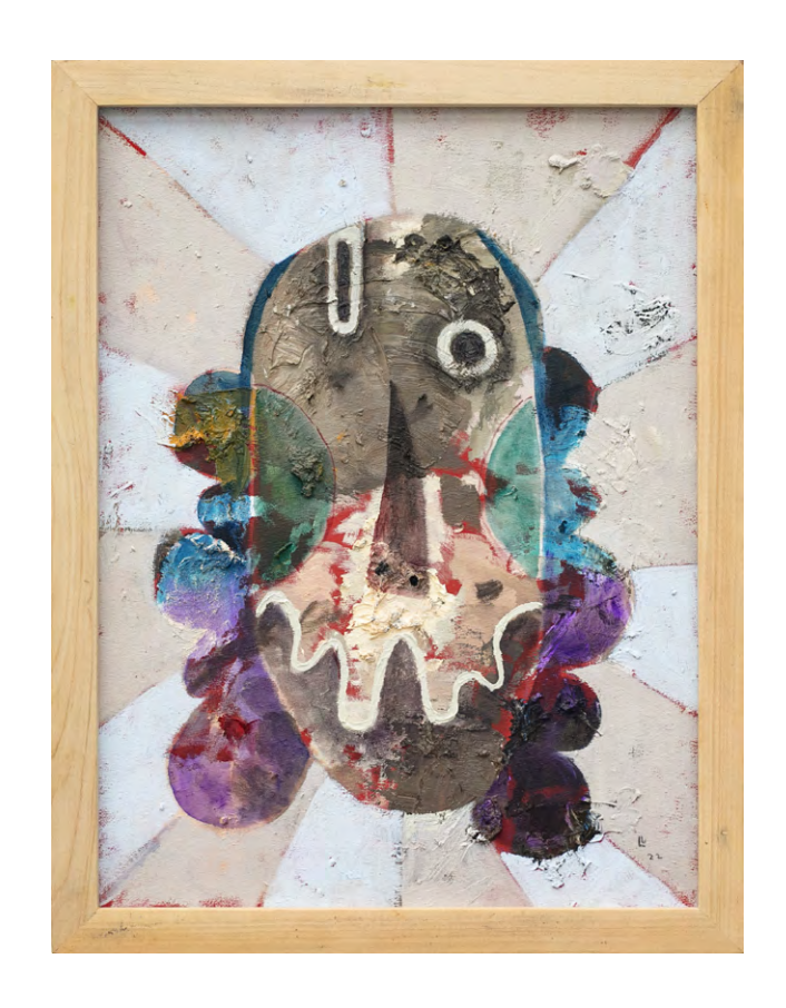
Head 11 , 2022 acrylic & oil on canvas 16h x 12w in • 40.64h x 30.48w cm