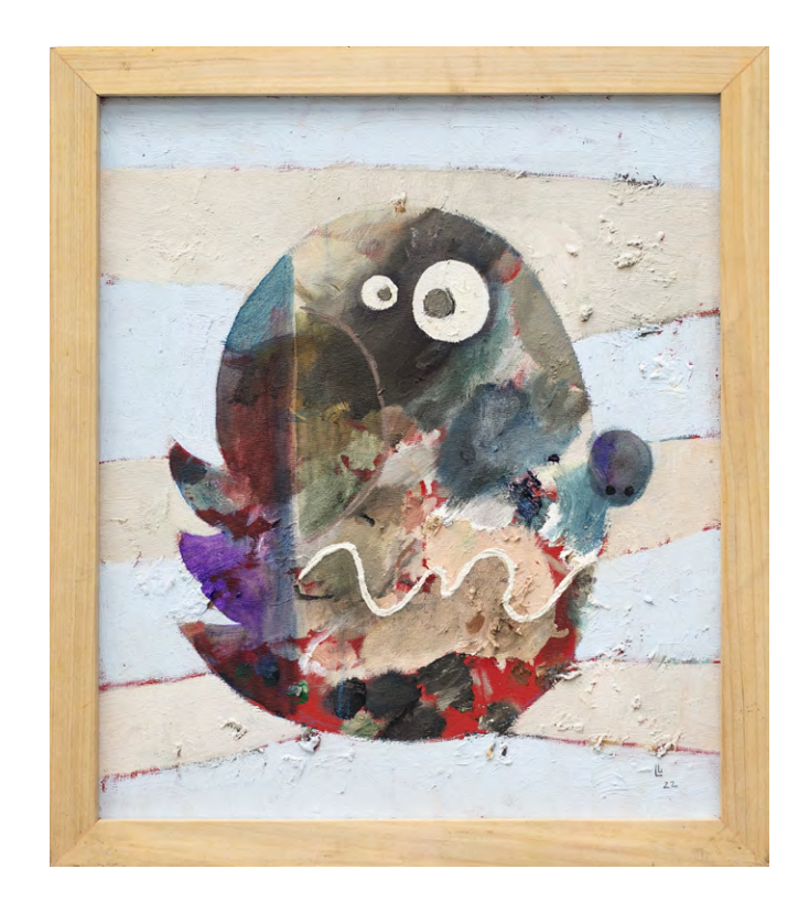
Head 6 , 2022 acrylic & oil on canvas 14h x 10w in • 35.56h x 25.40w cm