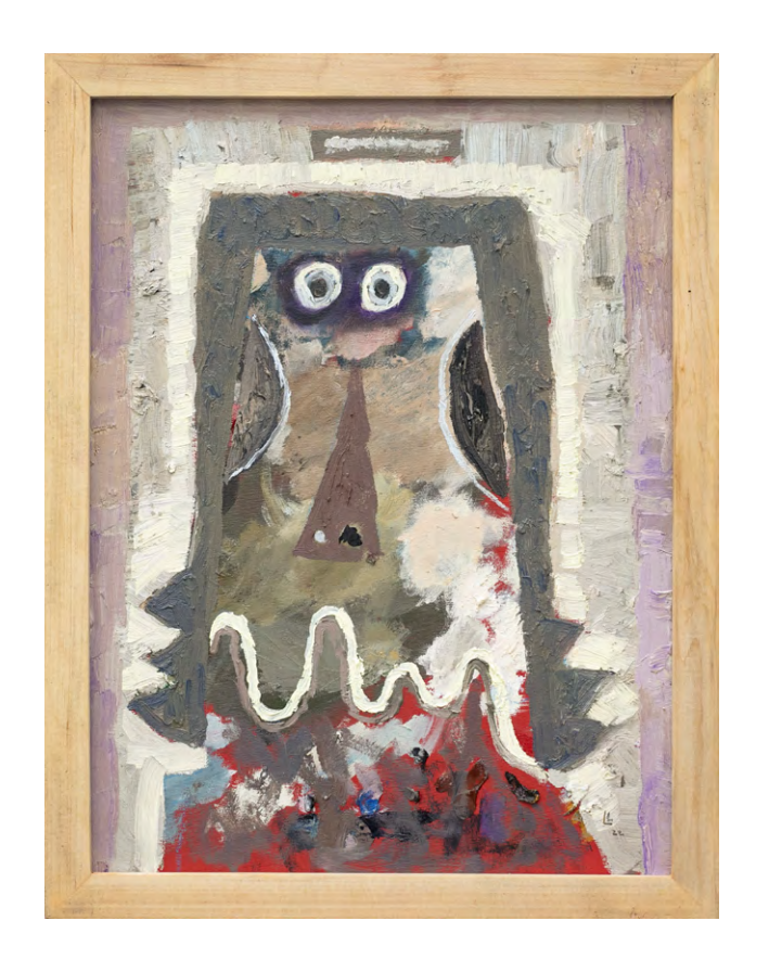
Head 9 , 2022 acrylic & oil on canvas 16h x 12w in • 40.64h x 30.48w cm