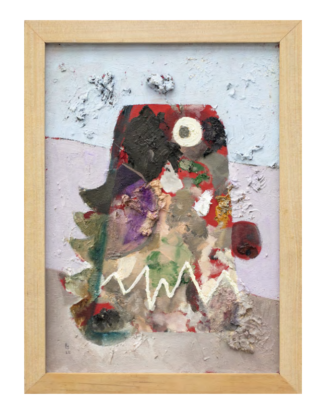
Head 2 , 2022 acrylic & oil on canvas 14h x 12w in • 35.56h x 30.48w cm