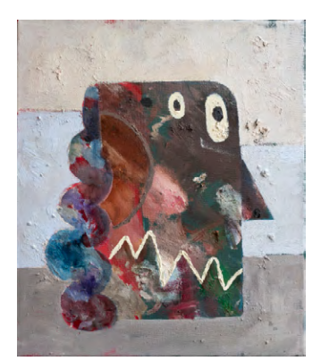
Head 2, 2022