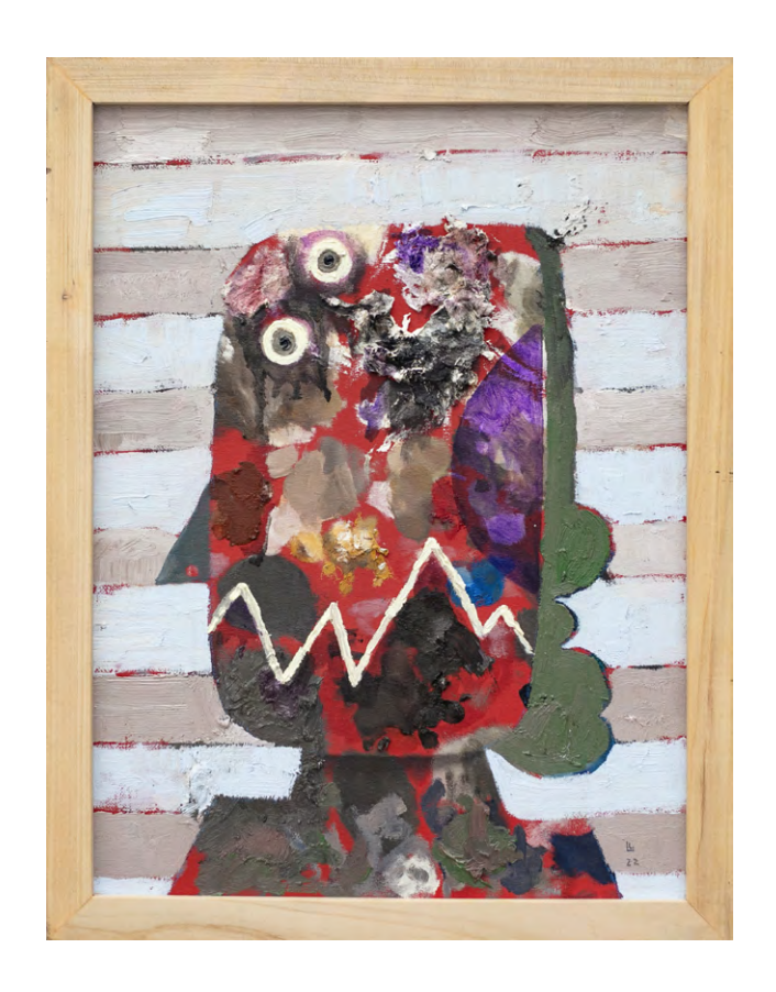
Head 13 , 2022 acrylic & oil on canvas 16h x 12w in • 40.64h x 30.48w cm