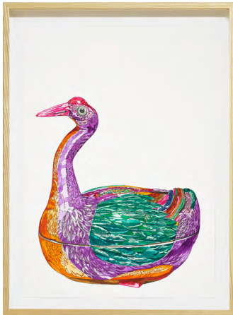
Notes on Decomposition (Lot No. 322), 2021