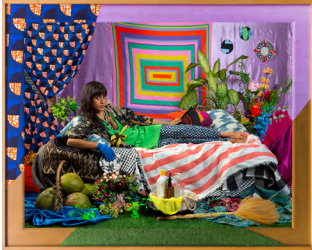
La Bruja (All the Places She's Gone, Self-Portrait) , 2019