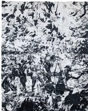
Death of Magellan (After Amorsolo), 2019